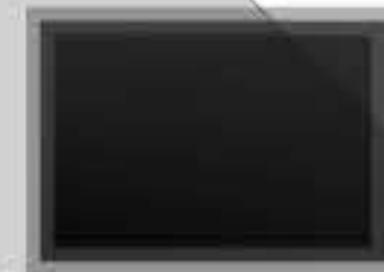
MC Matt Black